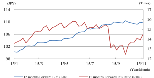
"Chart 2: 12 months forward EPS and P/E ratio"

(Note) Data period is from January 8th to November 12th, 2015. 12 month forward EPS and P/E ratio of Tokyo Stock Exchange Index (TOPIX). (Source) SMAM, based on Bloomberg L.P. data.